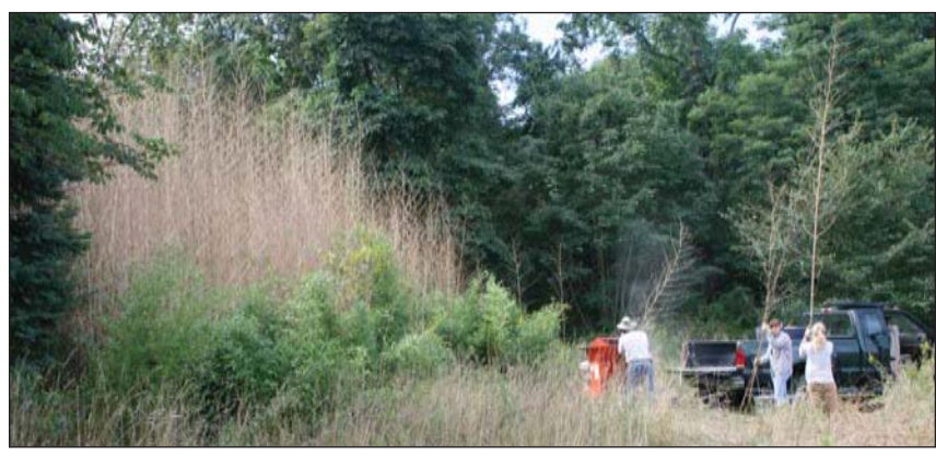
USDA-ARS researchers harvest bamboo from a northern Ohio planting, with some canes as tall as 30 feet.

cessed through a hammermill equipped with a \frac{3}{16} -inch screen produces substrates with particle size distribution similar to bark substrates currently used. Despite similarities in particle size distribution, alternative materials tend to hold less water and have greater air space than pine bark. Amendment with sphagnum