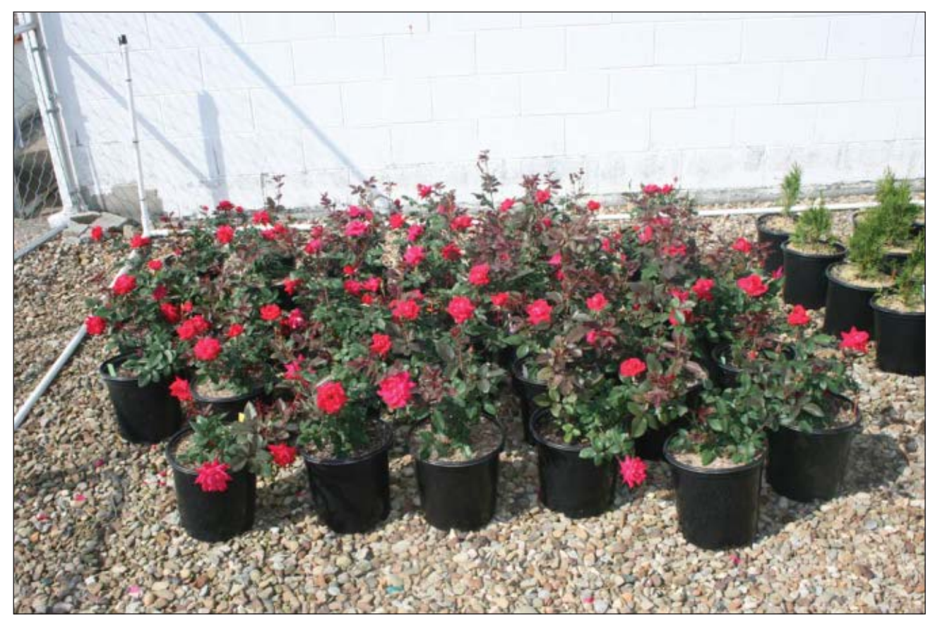
Roses grow vigorously in substrates composed of either pine bark or switchgrass.

The outlook for pine bark doesn't look any better. When former President George W. Bush enacted the Energy Independence and Security Act, he set a goal for the amount of biofuel added to gasoline to be raised from 4.7 billion