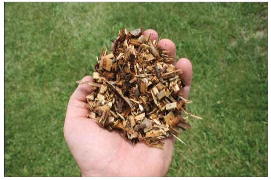
Willow chips harvested from a willow farm in western New York.

gallons in 2007 up to 36 billion gallons by 2022. Not to be outdone, President Obama set a goal of 60 billion gallons of biofuel by 2030. The Department of Energy predicts that at least 27 percent of that goal will be met with forest feedstocks, with southern pine plantations being the ideal source for trees. And energy entrepreneurs all over the country are starting bio-reactors and biofuel burners to generate energy from agricultural and industrial waste materials. The days of finding an abundant organic waste material to serve as a potting substrate have past.